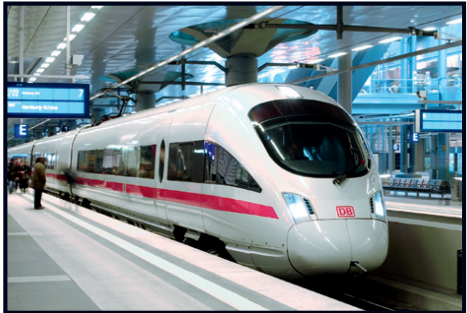
OCTOPUS switches are part of the passenger information systems of modern trains