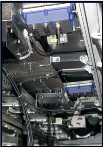
OCTOPUS mounted in the roof area of a train